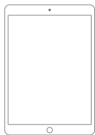
iPad Air 2 16GB 64GB 128GB

Maroo 3109 NE 109th Ave. Vancouver, WA 98682 360-883-0333 phone 360-883-4888 fax